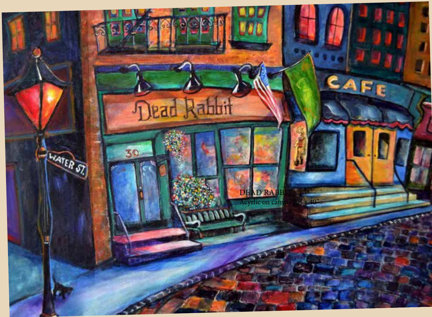
DEAD RABBIT Acrylic on canvas 30" x 40"