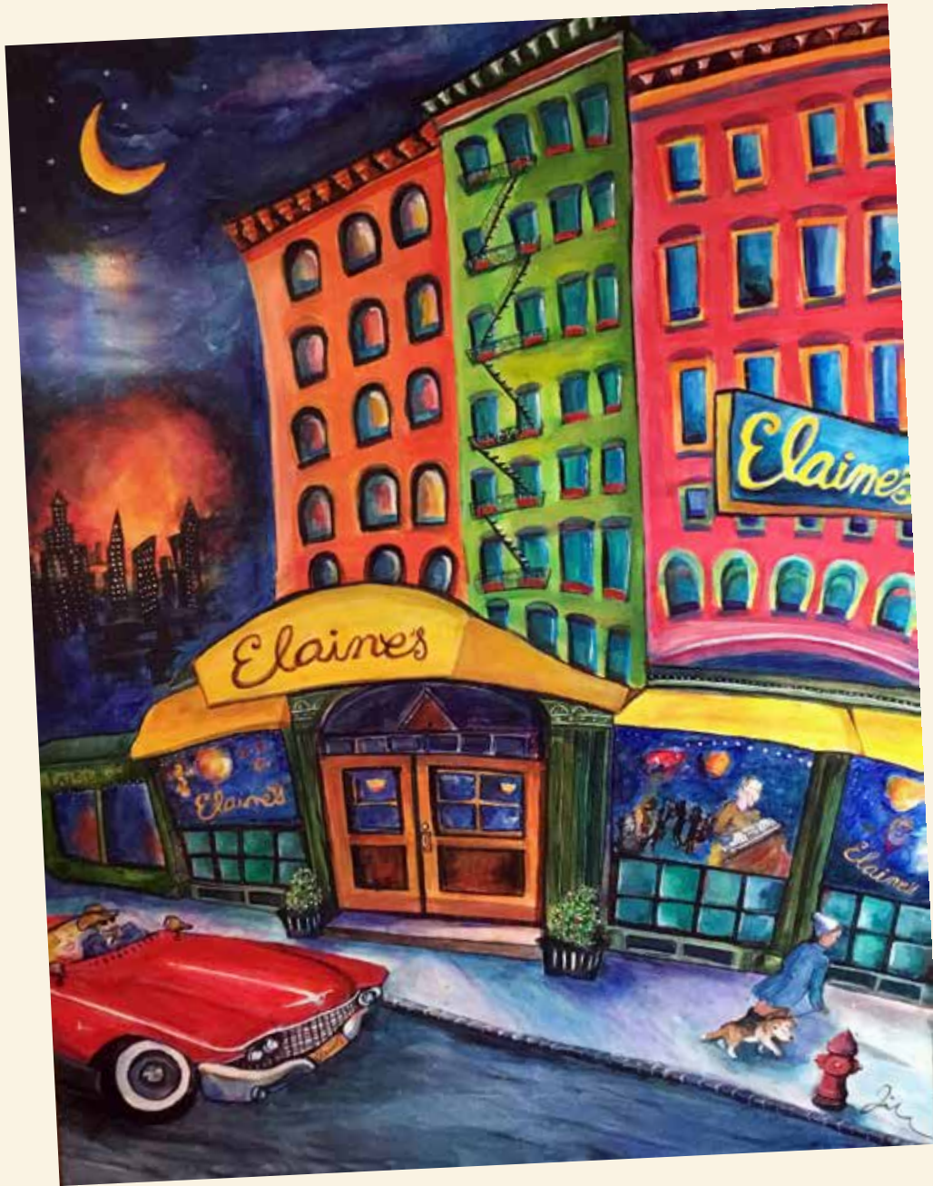
ELAINE'S Acrylic on canvas 30 x 40"