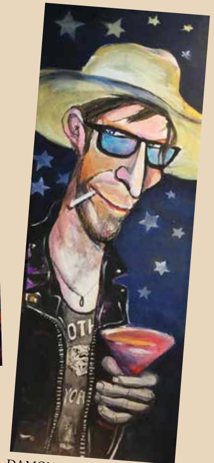
DAMON BOELTE Acrylic on canvas 12" x 36"