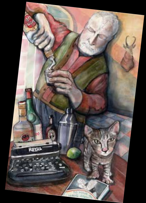
ERNEST AND HAIRY Watercolor on Arches 18 x 24"