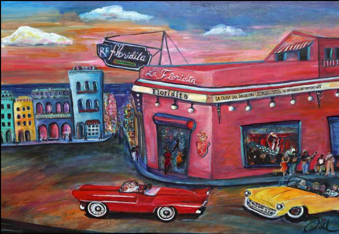
LA FLORIDITA Acrylic on canvas 24 x 36"

"Don't bother with churches, government buildings or city squares. If you want to know about a culture, spend a night in its bars."